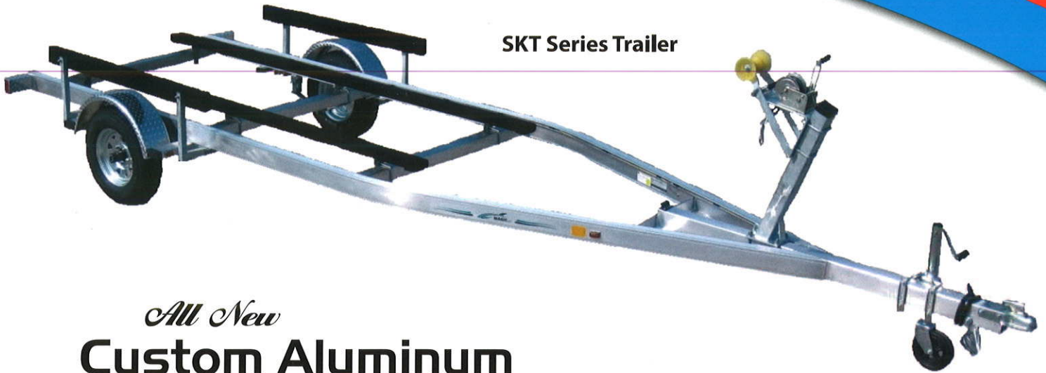
SKT Series Trailer